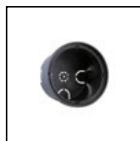
S.4612 RECESSING BOX Dimensions Ø 98 mm Width 95 mm

Available until 31/12/2020 but subject to stock levels