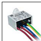
S.2498 SURGE PROTECTION DEVICE 10kV CLASS I Compatible with all lighting fixtures classified under electrical Protection Class I Rated voltage 230-277V SPD type 2+3 Max Surge Protection 10kV IP67

Available until 31/12/2020 but subject to stock levels